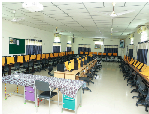
COMPUTER SCIENCE LAB I