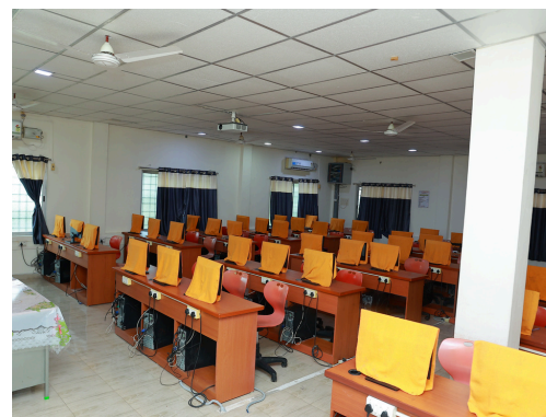
COMPUTER SCIENCE LAB II