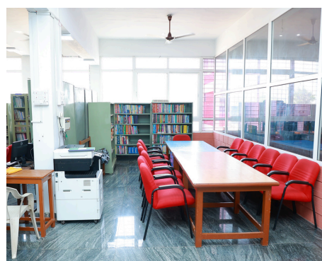
CAREER GUIDANCE SECTION